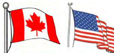
Table 1. KEY COMPARATIVE METRICS

The next chapter of the story involved a realization in BC during the late 1990s that primary care was both the most critical area of the health services continuum (see Chart #2, page 6), and one that was failing. This stimulated a multi-pronged strategy to repair and restore family practice that aimed to move the discussion off just a fee schedule